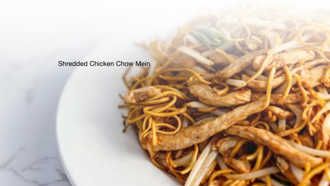
Shredded Chicken Chow Mein