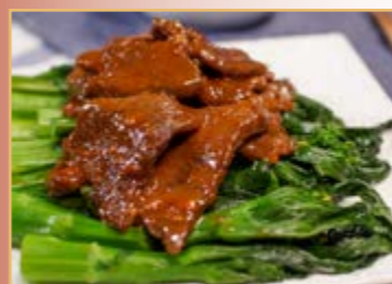
Stir Fried Beef in Sa Cha Sauce with Kai Lan