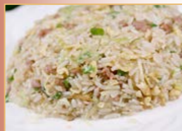
Fried Rice with Minced Beef