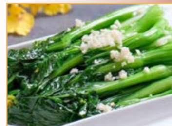
Choi Shum with Garlic

Steamed Choy Sum with Willow Mushroom (V)