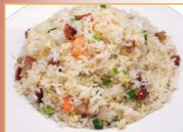
House Special Fried Rice