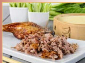
Crispy Aromatic Duck

Sesame Prawn on Toast £9.50 (Small Triangles of Bread, Brushed with Egg & Coated with Minced Shrimp)