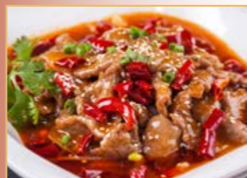
Boiled Beef in Szechuan Style