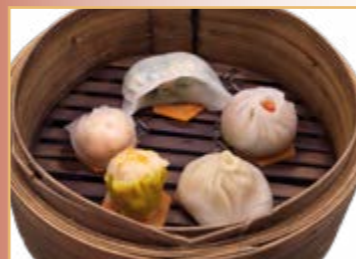
Special Steamed Dim Sum Platter (5pcs)