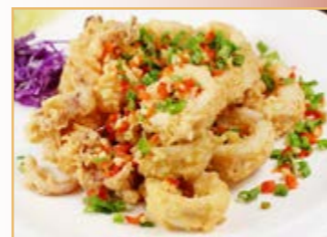
Squid with Salt & Pepper