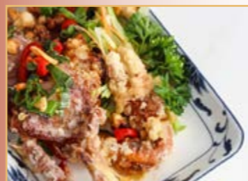
Soft Shell Crab with Salt & Pepper