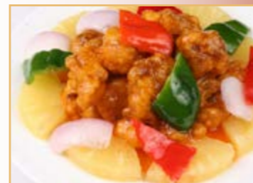
Stir-fried Sweet & Sour Pork Ribs