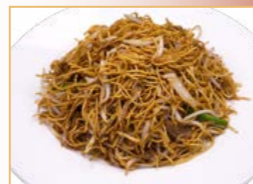
Chow Mein (V)