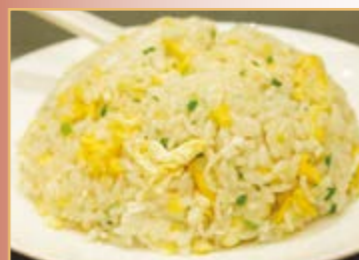
Golden Egg Fried Rice