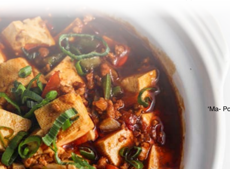
'Ma- Po' Tofu

Chinese Three Coloured Steamed Eggs £14.80