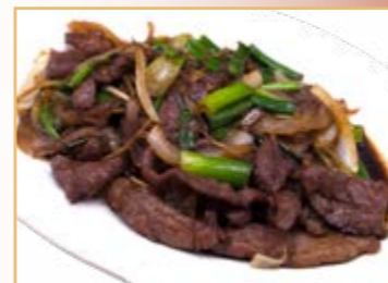
Lamb with Cumin