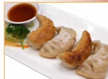
Chicken Dumplings (4pcs)