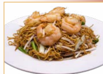
King Prawns Chow Mein