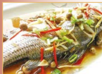
Steamed Seabass Fish with Ginger & Spring Onion