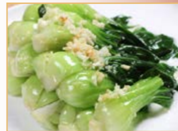
Pak Choy with Garlic