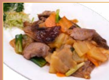
Duck Breast with Ginger and Pineapple

A discretionary 12.5% service charge will be added to the bill.