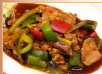
Chicken with Black Bean Sauce & Chilli