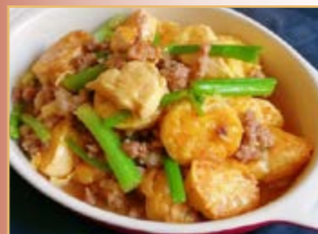
Braised Bean Curd with Minced Pork & Willow Mushroom