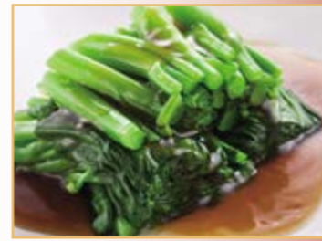
Chinese Kai-Lan with Oyster Sauce