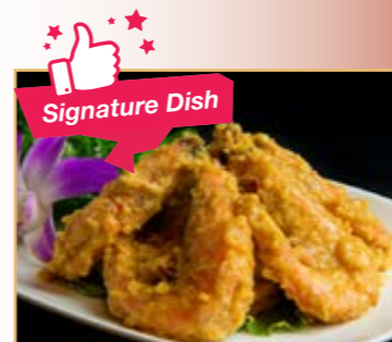
King Prawn with Golden Salted Duck Egg Yolk (with Shell)