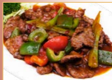
Beef with Black Bean Sauce & Chilli