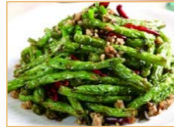
French Beans with Chilli Bean Sauce