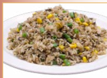
Vegetable Fried Rice with Preserved Olive Leaf (V)

A discretionary 12.5% service charge will be added to the bill.