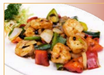
King Prawn with Black Bean & Chilli