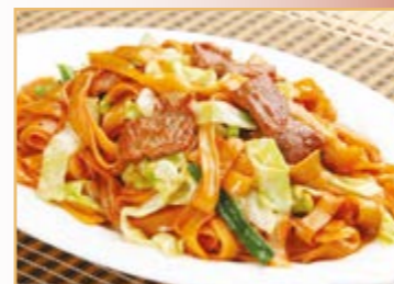
Beef Ho Fun