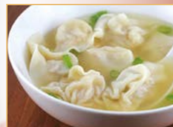
Won Ton Soup