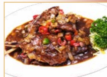
Lamb Cutlet with Black Pepper Sauce