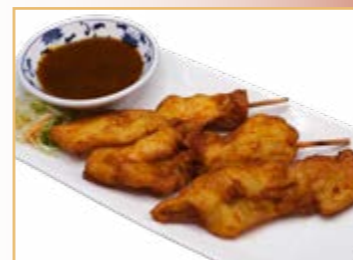
Satay Chicken on Skewer