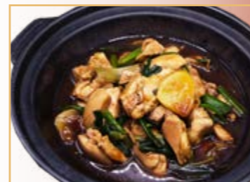
Drunken Ginger Yellow Wine Chicken