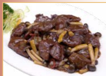
Fillet Diced Steak with Willow Mushrooms & Peppers in Black Pepper Sauce