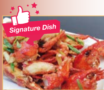
Braised with Ginger & Spring Onion

Stir-Fried Scallops with Kai-Lan and Matsutake Mushrooms £22.80 (Stir-Fried Scallops with Kai-Lan (Chinese Broccoli) Matsutake Mushrooms with Bamboo Shoots in Ginger, Garlic and Spring Onion Sauce)