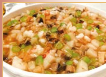
Fujian Fried Rice