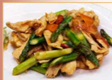
Asparagus & Chicken with XO Sauce