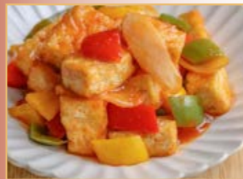
Tofu with Sweet & Sour Sauce (V)