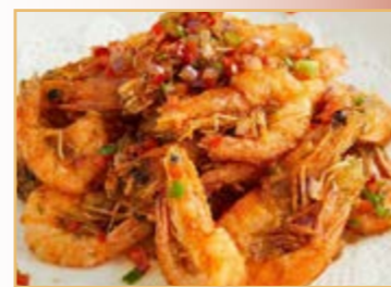
King Prawn with Fried Garlic & Dry Chilli (with Shell)