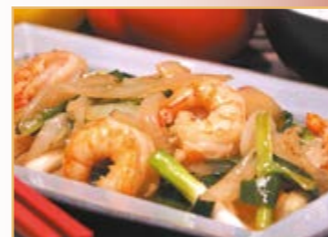
King Prawns with Ginger & Spring Onion