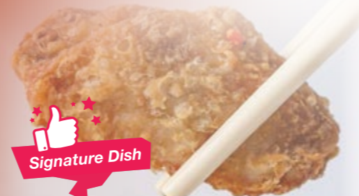
Chicken Wings with Salt & Pepper (6)