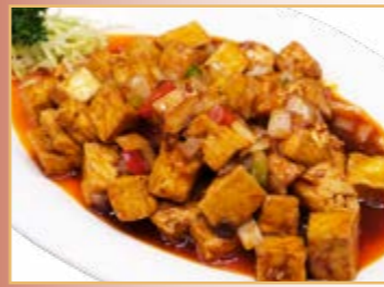
Tofu with Szechuan Chilli Sauce (V)