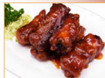
Spare Ribs with Chinese BBQ Sauce