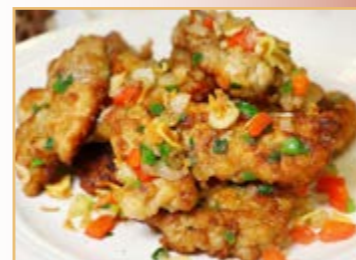
Pork Chop with Salt & Chilli Pepper