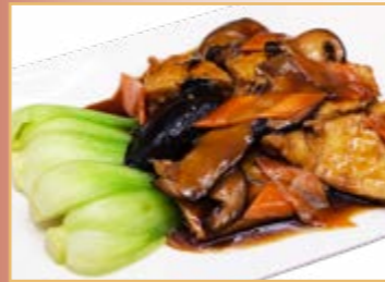
Dry Braised Tofu with Mushroom (V)