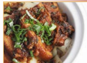
Stewed Pork Belly with Preserved Vegetables in Hot Pot