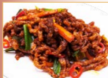
Crispy Chilli Beef