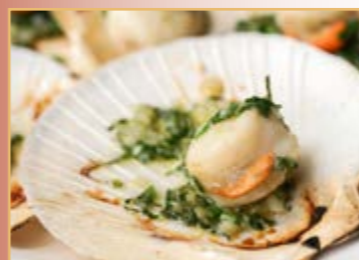
Steamed Scallop with Garlic