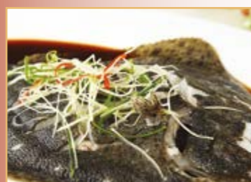
Steamed Turbot Fish with Ginger & Spring Onion