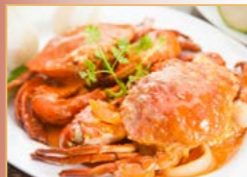
Braised with Curry Sauce