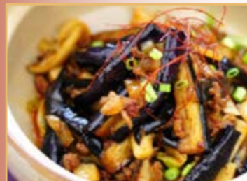
Aubergine, Tofu in Hot Pot (V)