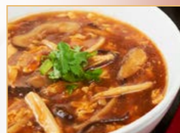
'Szechuan' Hot & Sour Soup