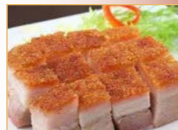
Crispy Pork Slices