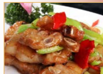
Honey and Black Pepper Pork Chop